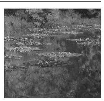
Claude Monet, "Le Bassin des Nympheas," 1904, oil on canvas, 34 5/8 x 36", is currently on view at the San Diego Museum.

Alison Knowles presents a poetry machine, "A House of Dust" (1967). A dot-matrix printer prints continuous computer-generated poetry. It spawns nonsensical words that randomly produces rubbish, intelligent, humorous, or eloquent poetic expressions. David Bowen conjures one of the hits of the show, an "Infrared Drawing Device" (2003) sensors that allow a human hand, not touching paper or charcoal, to make random drawings based on hand motions in the air. Sol LeWitt's "Wall Drawing 76" (1971) was reproduced by UCI students. On a large white wall, meticulous and close vertical lines of various lengths are drawn with black graphite. Known for his Minimal and Conceptual explorations, the work conveys LeWitt's idea to allow others to execute his creative process. Shirley Shor's "Landslide" (2004) continually generates animated images projected downward onto a sandbox below. The piece speeds up time, conveying the beauty of a continuous changing topography. in "Enough is Plenty" (1969) Frederick Hammersley uses a punched card process to produce ink drawings on paper composed of complex shapes and patterns. This was one of the first computers designed to produce visual art. Lastly, "Reunion" (1968-2017) is a recreation of a collaboration between John Cage, Marcel Duchamp and Teeny Duchamp. An electronic musical chess board emits various