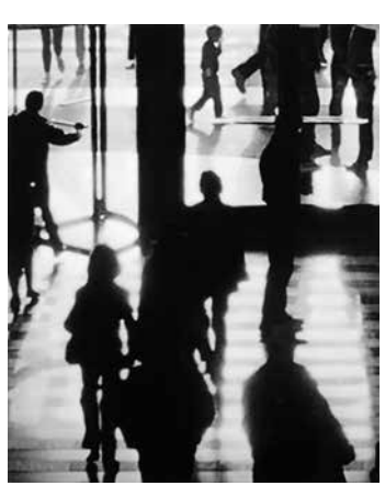
Sherry Karver, "Revolving Door1," 2017, photo images, oil and resin surface on wood panel, 24 x 20", is currently on view at Greenwood.

Sherry Karver is a chronicler of humanity, both visually and through the intricate text that she writes onto her photo-collages. Looking at her depictions of crowd scenes, created with photography, painting, digital alteration and resin, and spending time reading her detailed texts, revealing the presumed inner thoughts of her characters, can feel deliciously voyeuristic. Karver, who titles this exhibition "True Story" is also a traveler and people watcher, spending long hours in train stations, shopping centers and museums throughout the U.S. and foreign capitals. While observing crowds of often self-obsessed individuals, she takes black and white photos of them, which become primary source material. She alters the photos, adding color, details and shadows, and blurring some images. She then overlays detailed, handwritten texts onto the individuals' bodies, revealing their supposed inner thoughts. Onto a portrayal of a middle aged man in "Mystic Moments," the text reads, "Still dreams of