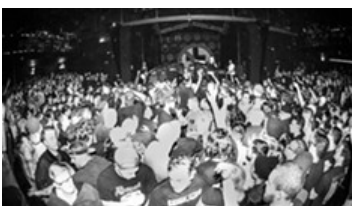
November 1 at 2:06 p.m. Bad Religion @ The Observatory