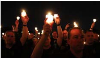
Upcoming Overdose Awareness Day in Huntington Beach Urges Harm Reduction