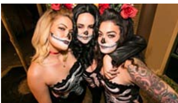
November 1 at 11:06 a.m. Halloween 2016 in Downtown Fullerton