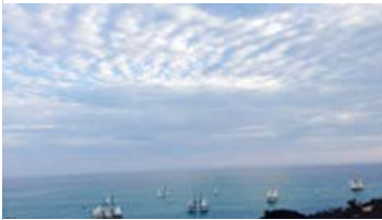
Friday after Labor Day Is South County's Best Beach Day of the Year