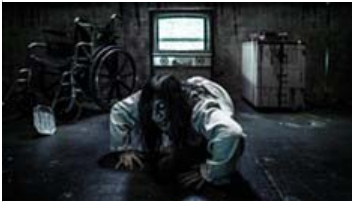
7 Ways to Bring Knott's Scary Farm's FearVR: 5150 Back from the Dead