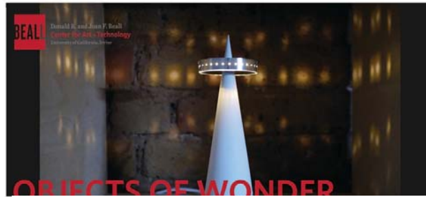
Real Prediction Machines (RPM), 2015, by James Auger and Jimmy Loizeau