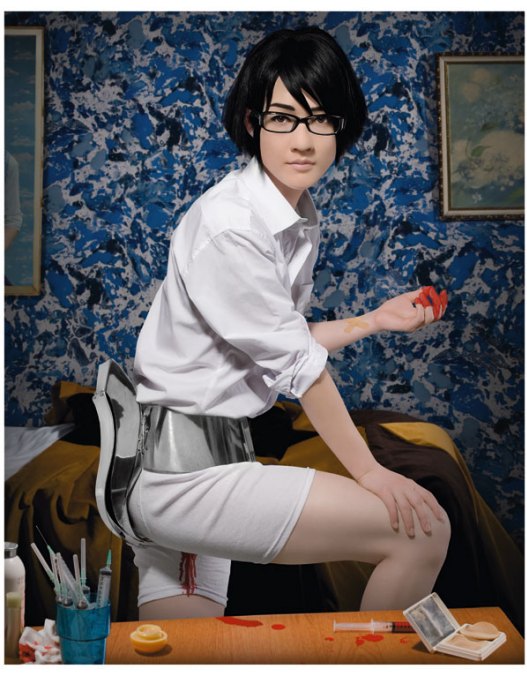
Masculine Feminine. Hiromi Ozaki. Menstruation Machine. 2010.

Hanging eye level in the gallery is a metal belt that looks like a futuristic chastity belt. Next to it, a music video plays showing a Japanese transvestite wearing this Menstruation Machine , this aluminum belt equipped with electrodes which stimulate the lower abdomen to replicate menstrual cramps. In addition, the device has a blood-dispensing system so that menstruation, often associated as private or even embarrassing, is publicized.